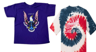
Approved Styles Color Varies by Class