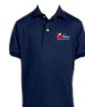
Long Sleeve Polo